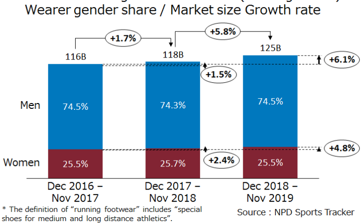
<Chart 2> Running footwear market (excl. age 0-12) Wearer gender share / Market size Growth rate

The size of the running footwear market (excl. age 0-12) in 2019 (YE Nov'19) was 125 billion yen. The growth rate in 2019 (YE Nov'19) increased by 5.8% as described above, but by gender of wearers (Chart 2), men who accounted for about 3/4 increased 6.1% and women who accounted for 1/4 increased +4.8%. This means that men are driving market growth.